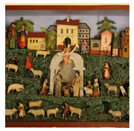
This Nativity, made in Austria in the late 19th century, was built into a wooden drawer with a glass cover. Such scenes often included a backdrop reminiscent of the town where the artist lived.