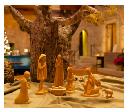
Under the Tree Nativity.