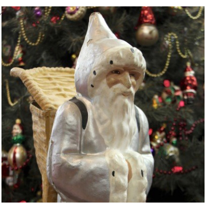
Père Noël is the French equivalent of Santa Claus. This turn-of-the-century papier-mâché figure – a candy container – is part of the Christmas Traditions of Many Lands exhibit.