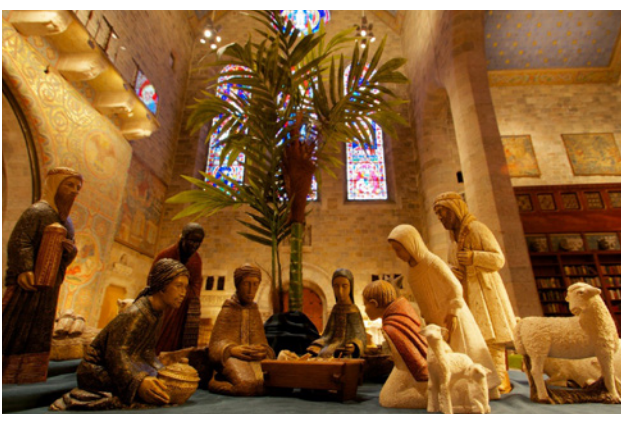
Each year Glencairn borrows crèches from other collections. This 2013 Nativity, made in a French monastery by the Sisters of Bethlehem, was loaned by the Mepkin Abbey in South Carolina.