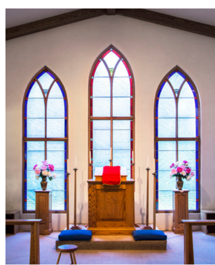
The Sower's Chapel Church chancel