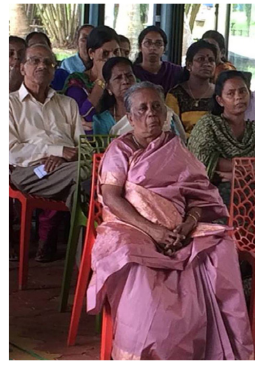
Some of the seminar participants