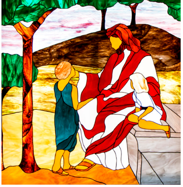
New Church of Phoenix stained glass window