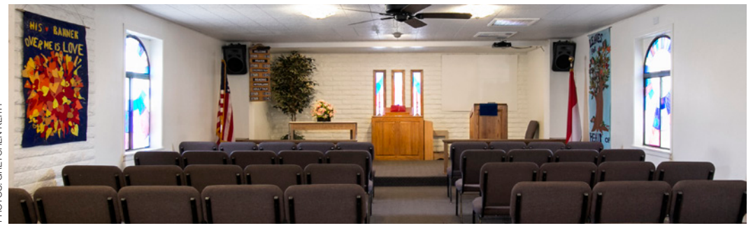
New Church of Phoenix interior