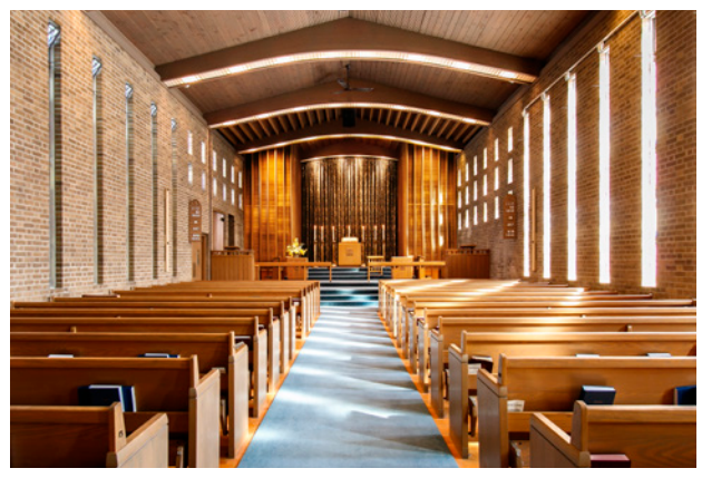
Olivet New Church interior