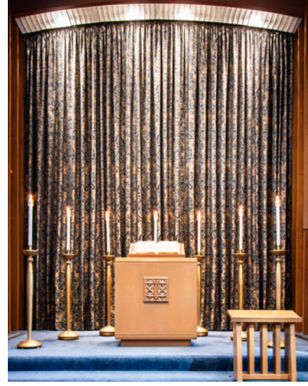
Olivet New Church altar