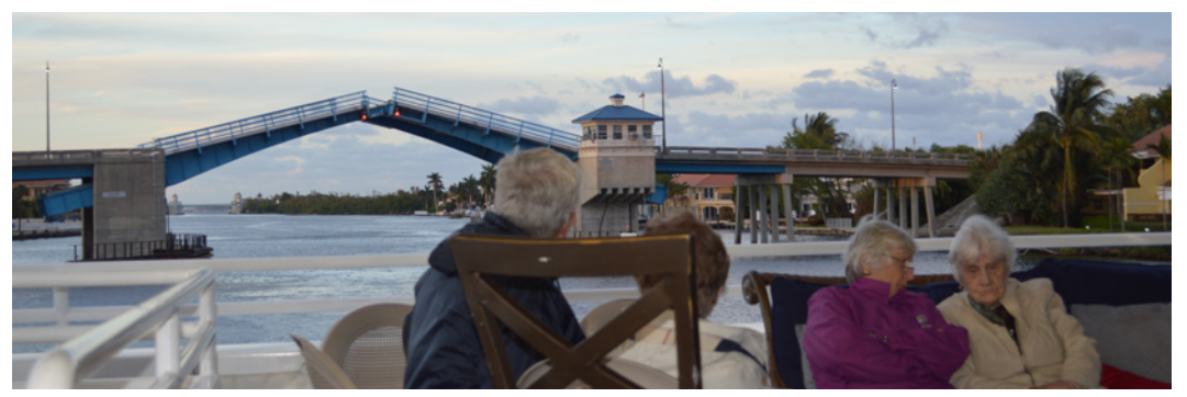
Drawbridge closing behind boat