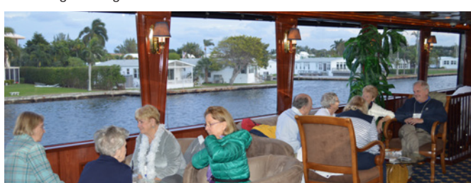
Along the Intercoastal Waterway