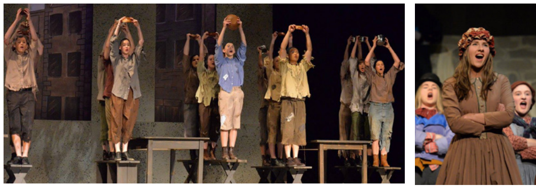
The opening number, "Food, Glorious Food!" performed by the Workhouse Boys