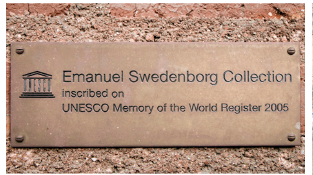
Emanuel Swedenborg Collection UNESCO plaque