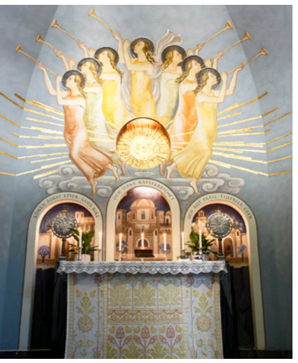
Stockholm church chancel