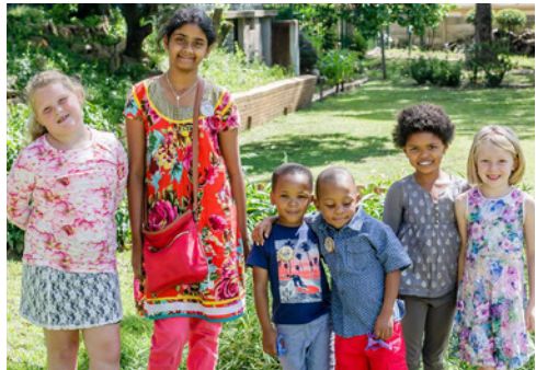
The children are a big part of our congregation and bring much joy

CELEBRATION SUNDAY FOR LIVING GRATEFULLY JOURNEY PROGRAM - BUCCLEUCH NEW CHURCH, AFRICA