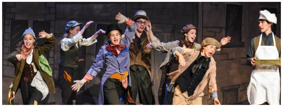
Fagin's Gang, along with the Artful Dodger and Oliver, perform the musical number "Consider Yourself"