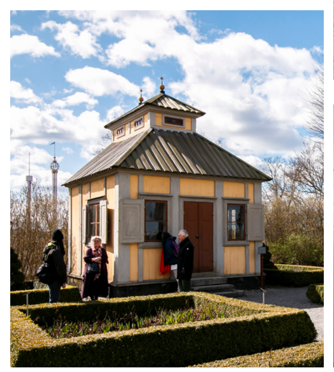
Swedenborg's Summer House at Skansen