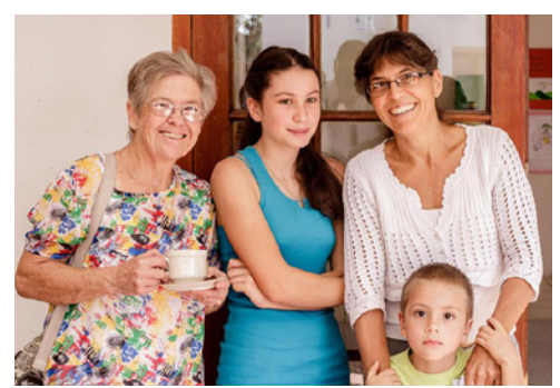
An opportunity for family to travel from afar and be a part of the special day