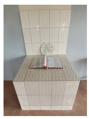
The altar in the new Temple Bethel