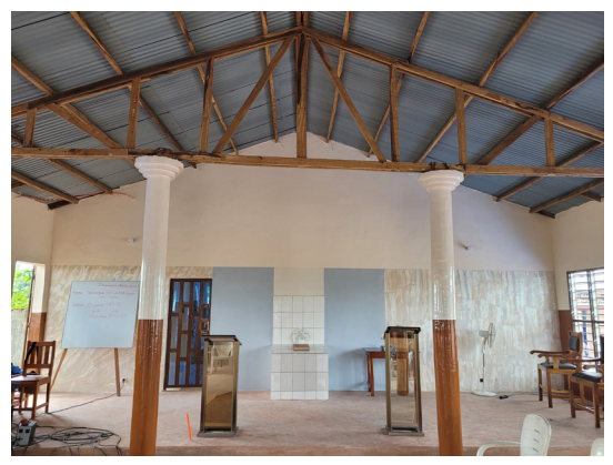
The new Temple Bethel sanctuary in Benin